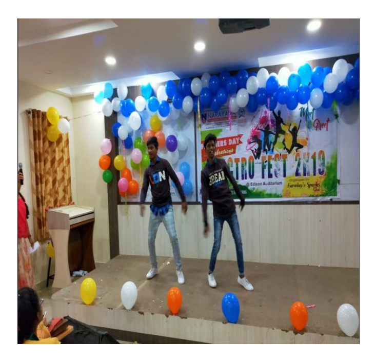
Student performing the dance.