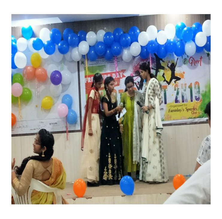
Student performing the singing