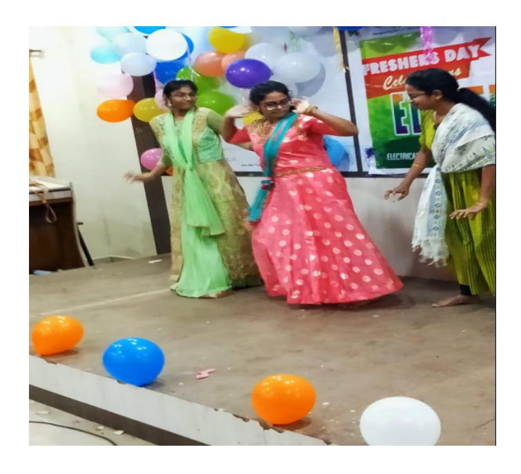
ESHERS DAY Leated Control of Edison Audit